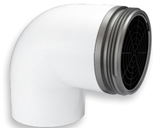
adapters and plugs sold separately