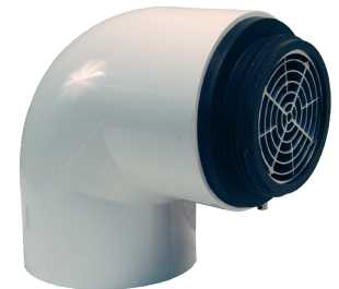
adapters and caps sold separately