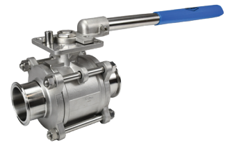
2-1/2" to 4"