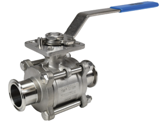
1/2" to 2"