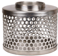
304 stainless steel