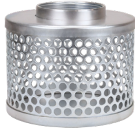
zinc plated steel