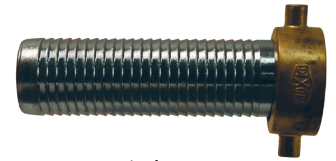
pin lug nut