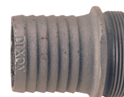
1" - 2-1/2" male