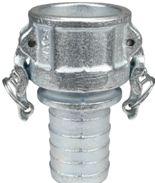
plated malleable iron