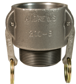
unplated malleable iron