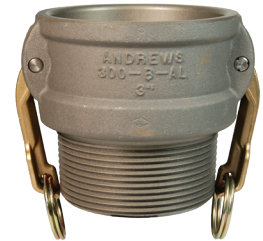
aluminum hard coat