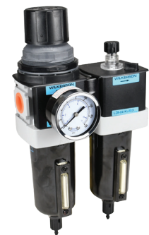
with metal bowl