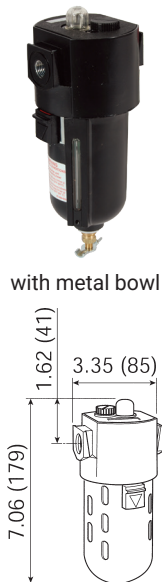
with metal bowl