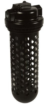
with transparent bowl