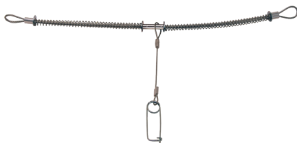
WB1C – WB1 with safety clip and lanyard