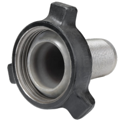
3" and 4"