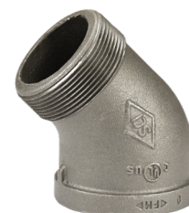
150# galvanized iron