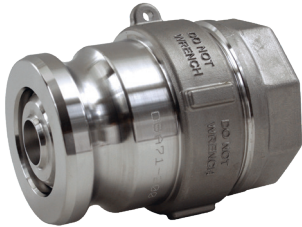
Adapter x 1-1/2" and 2" Female NPT