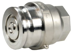
Adapter x 3" Female NPT