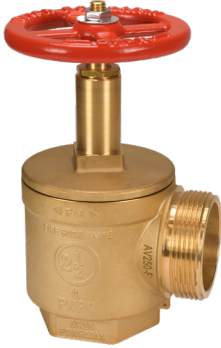
AV250 -F female x male