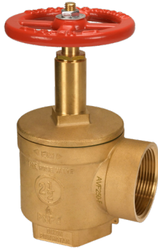
AVF250 - F female x female