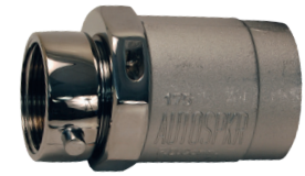
polished, chrome plated