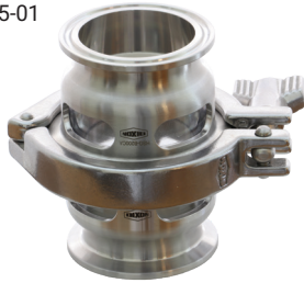
single pin clamp