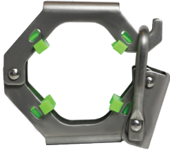
clip style in closed position

The 24TH-series threadless tube hanger from Dixon® introduces a new level of efficiency and hygienic design to the hanger market by incorporating a snap-secure latch system, simplifying and significantly reducing installation time by eliminating the standard thread design.