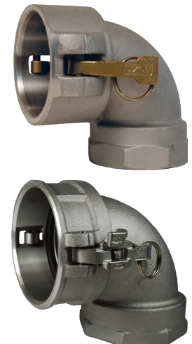
EZ Boss-Lock design