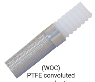
(WOC) PTFE convoluted non-conductive