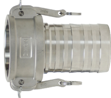
316 investment cast stainless