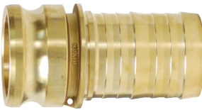
C38000 forged brass