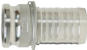
316 investment cast stainless

Only use the crimp style shanks with the crimp style sleeves and ferrules.