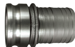
unplated ductile iron